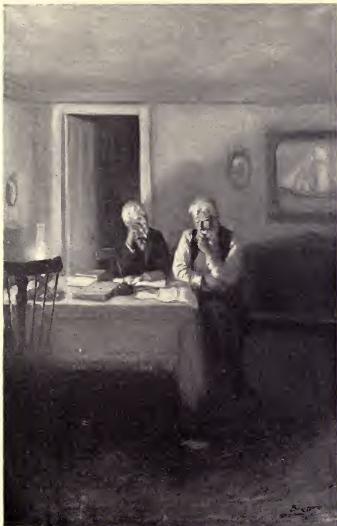
“‘She mustn’t know we’re worried’”